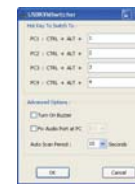
Configuration Dialog Box