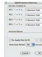
Configuration Dialog Box

Mac users can enable the "Open at Login" and "Keep In Dock" options in the operation menu.