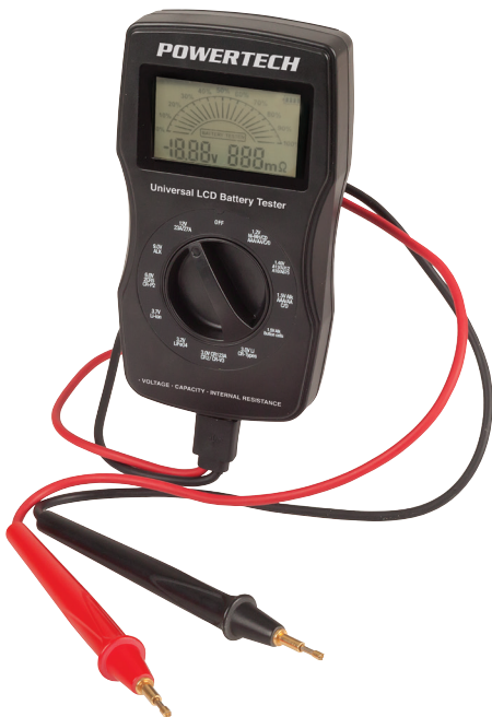
Universal Battery Tester QP-2260 User Manual