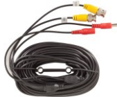
1 x 18m Video & Power Cable