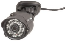
1 x 1080p 4-In-1 Bullet Camera