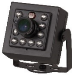
1 x 1080p Mini AHD Camera