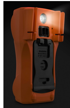
Figure 2. The built-in flashlight as illustrated