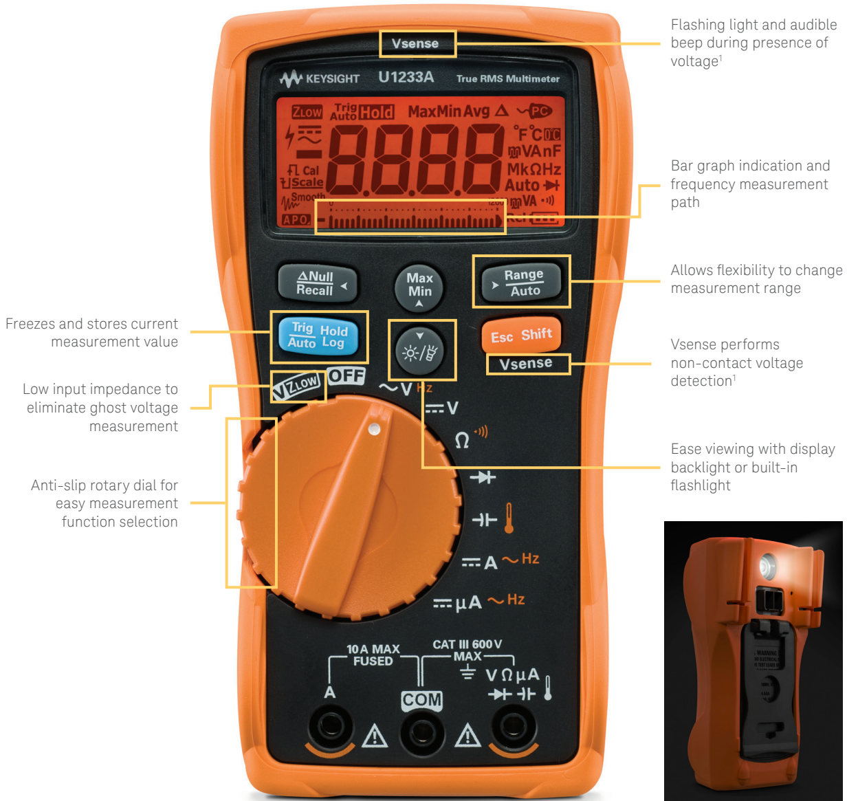
Figure 1. U1230 Series front view